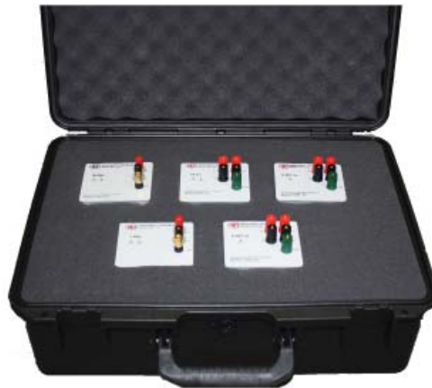
SRC-10-n Transit Case for n units (5 units shown)