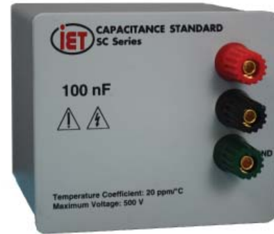
SCA Capacitance Standard