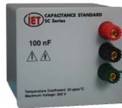
SCA-100nF (1.9 nF < values < 1μF)