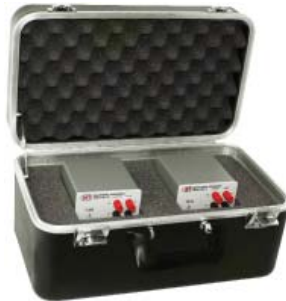
SRC-100 Transit Case for 2 units

changes during transportation or shipping. It is suitable for transporting and storing two or more units.