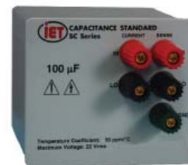
SCA-100μF (values > 1μF)