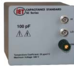
SCA-1nF (values ≤ 1.9 nF)