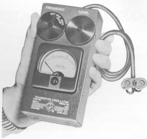
Figure 1. Panel View of Type 1307-A Transistor Oscillator.