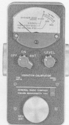
Figure 1. Type 1557-A Vibration Calibrator.