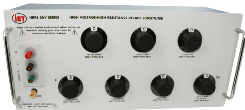
Figure 1-1: HRRS-5kV Series High-Resistance, High-Voltage Decade Substituter

The HRRS-5kV series complements the HARS series which provides resistance steps as low as 1 m \Omega . The units may be rack-mounted to serve as components in measurement and control systems.