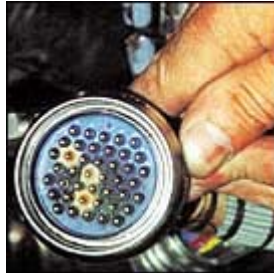
Figure 3.0: Hydraulic Fluid Damage

Hydraulic fluid used in aircraft comes in several types: water-based, mineral-based and synthetic type oils. Hydraulic fluid by its very composition is destructive to many materials. Contact with metal could result in corrosion of the contacts and with wiring it could eat through cable insulation. Figure 3.0 illustrates damage from hydraulic fluid to an electrical connector.