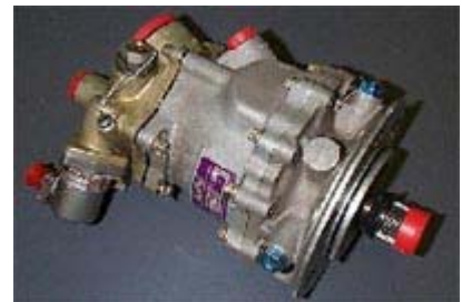
Figure 1.0: Generic Hydraulic Pump

Of concern for the hydraulic pump motor assembly inspection on the DC-10 aircraft is the rotor, the stator, the wiring and the motor bearings. The rotor had seized or was difficult to turn due to worn-out bearings on some of the old DC-10 auxiliary hydraulic pump motors. The outer material of the stator and the casing (insulation) of the motor wiring could be deteriorated over time by leaking hydraulic fluid.