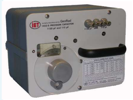
Model 1422-D Precision Capacitor

Construction - The capacitor assembly is mounted in a cast frame for rigidity. This