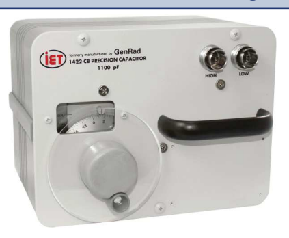
Model 1422-CB/CL/CC Precision Capacitor

Stator insulation in all models is a cross-linked thermosetting modified polystyrene having low dielectric losses and very high insulation resistance. Rotor insulation, where used (Types 1422-CB and -CL), in grade L-4 steatite, silicone treated.