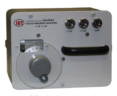
Model 1422-CD Precision Capacitor

Accuracy - The errors tabulated in the specifications are possible errors, i.e., the sum of error contributions from setting, adjustment, calibration, interpolation, and standards. When the capacitor is in its normal position with the panel horizontal, the actual errors are almost always smaller. The accuracy is improved when the readings are corrected using the 12 calibrated values of capacitance given on the correction chart on the capacitor panel and interpolating linearly between calibrated points. Even better accuracy can be obtained from a precision calibration of approximately 100 points on the capacitor dial, which permits correction for sight residual eccentricities of the worm drive and requires interpolation over only short intervals. This precision calibration is available for the 1422-CL model.