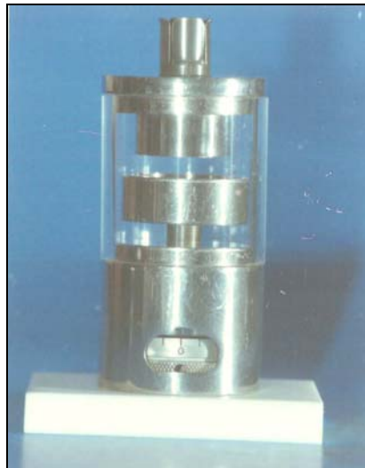
Figure 4 MC-100 Powder and Paste Dielectric Cell