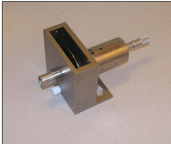
Figure 3 LD-3T High-Temperature Rigid Dielectric Cell