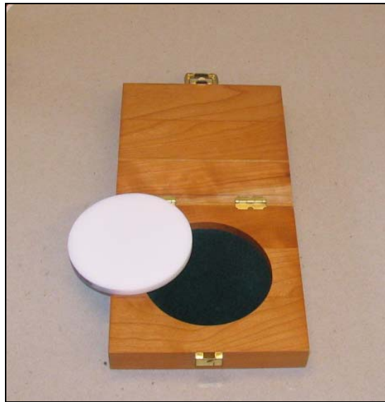
Figure 6 TS-100 Teflon Standard Cell