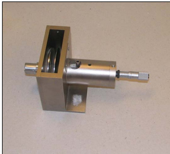
Figure 2 LD-3 Rigid Dielectric Cell