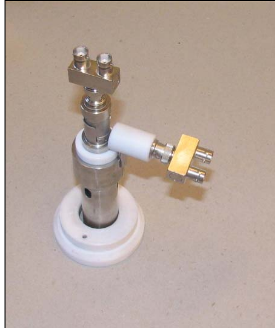
Figure 5 350 Liquid Cell