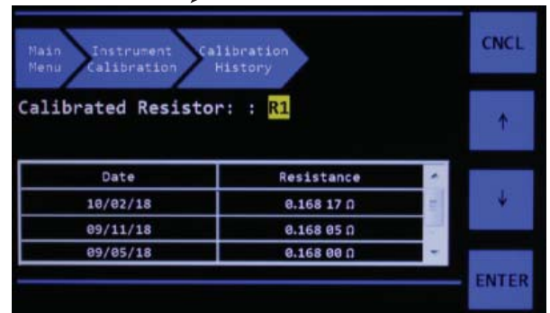
Calibration History Screen shows each calibrated resistor value and calibration date, and can be exported

Bread crumbs allow easy navigation in menus