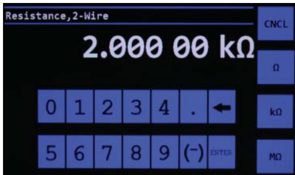
Resistance Entry Screen Keypad or touch screen can be used to enter resistance value

See relevant setup parameters on the main screen