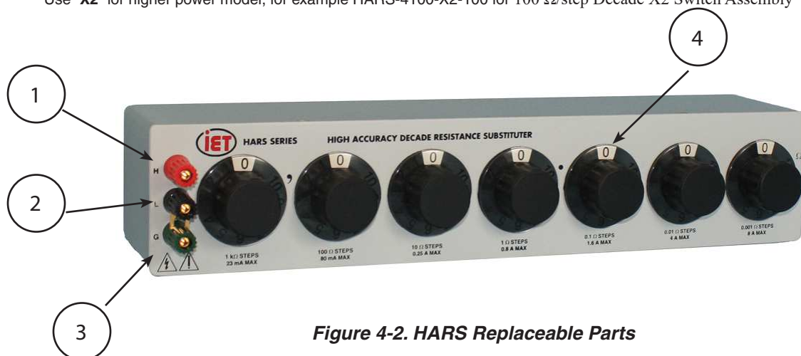
Figure 4-2. HARS Replaceable Parts

* Use "X2" for higher power model, for example HARS-4100-X2-100 for 100 \Omega /step Decade X2 Switch Assembly