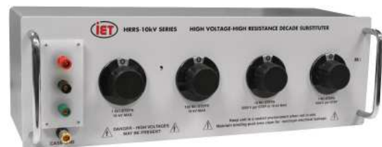
Figure 1-2: Example of an HRRS-10kV unit with 4 decades