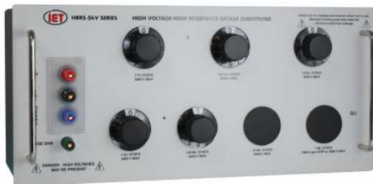
Figure 1-1: Example of an HRRS-5kV unit with 7 decades

The HRRS 5kV and 10kV series complement the HARS series which provides resistance steps as low as 1\text{ m}\Omega . The units may be rack-mounted to serve as components in measurement and control systems.