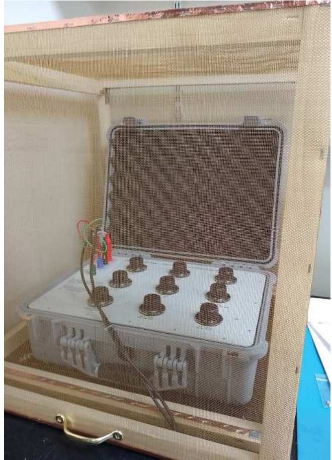
Figure 3-1: HRRS-WT in faraday enclosure

If this instrument is to be stored for any lengthy period of time, it should be sealed in plastic and stored in a dry location. It should not be subjected to temperature extremes beyond the specifications. Extended exposure to such temperatures can result in an irreversible change in resistance, and require recalibration.