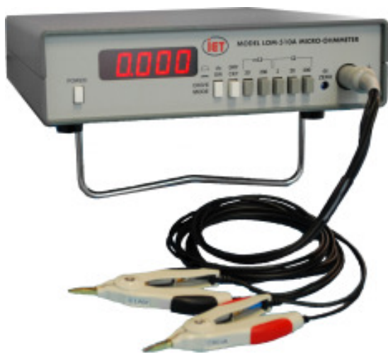
Figure 1.1 LOM 510A

The Model 510A has a 25 pin connector mounted to the rear panel which contains a set of parallel BCD lines which are driven with the same digits as the front panel display. This allows the instrument to interface to a companion limits comparator. In addition, the connector contains signal lines to allow the unit to be remotely triggered.